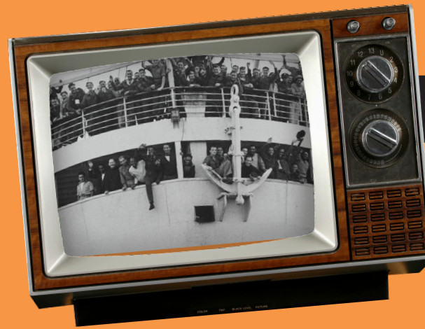
THE EMPIRE WINDRUSH; KS1 & KS2