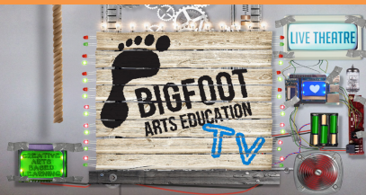
AFRICA; MY STORY; KS1 & KS2

Purchase all three of our films as a complete package for £300 + VAT