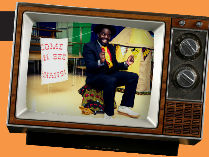
COME AN' SEE ANANSI; KS1 & KS2

Purchase all three of our films as a complete package for £300 + VAT